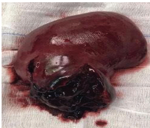
Figure 3: Large parenchymal hematoma in the superior pole of the spleen.

a situation known as "delayed splenic rupture (DSR)". DSR is defined as the rupture of the spleen 48 hours after injury and was first described by Baudet in 1902. He also described an asymptomatic period between injury and rupture, known as the "latent period of Baudet" [1].