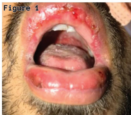
Figure 1: Erythema and ulceration of the palate (4th day of symptoms).

On two weeks follow-up, his chest x-ray showed significant resolution of right side consolidation (Figure 4) and there were no residual lesions in the oral cavity and urethra.