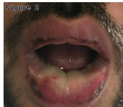
Figure 2: Swelling and sloughing of the mucosa of lips (5th day of symptoms).