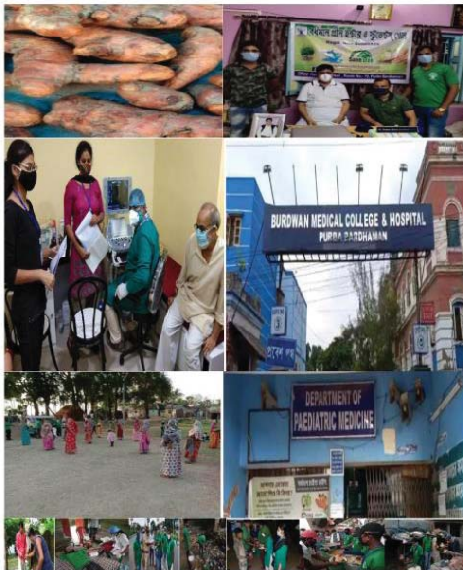
Plate 1: Turmeric rhizome, treatment, visiting, campain different activities in the slum area of Purba Bardhaman.

The study was done out by the doctors, headmaster, and young-local-Non-Governmental-Organization (NGO) named "Burdwan-Green-Haunter and Students'-Goal", at the 11-slam area of Purba Bardhaman District, India. Total families were 1907 and also the total population was 12315, and therefore the activities were conducted and measured from the 11th September 2020 to 17th July 2021 and up-to-date (Figure 1